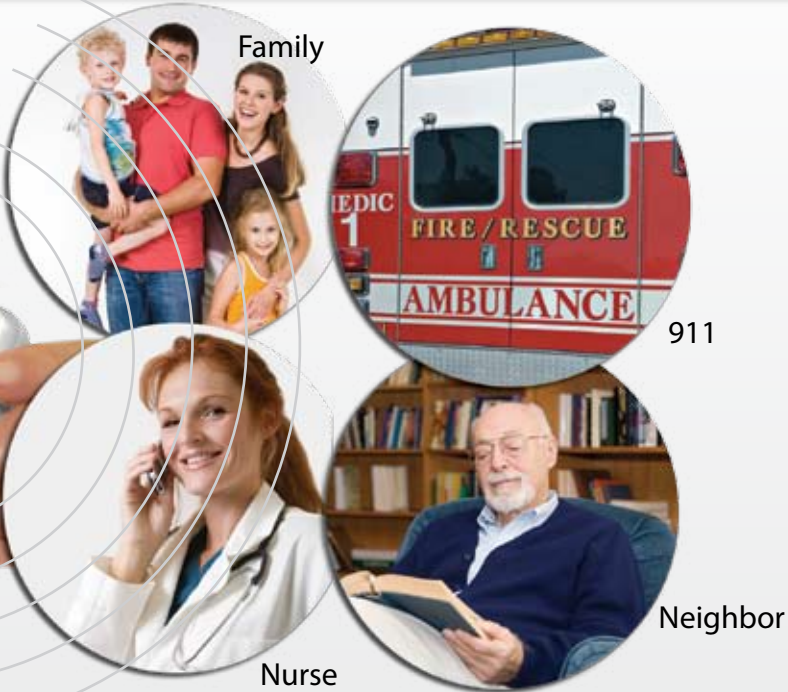
Typical PERS System